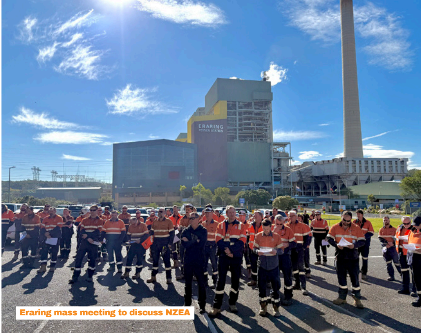
Eraring mass meeting to discuss NZEA