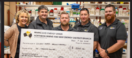
Mount Thorley Warkworth lodge contributing to Calvary Mater hospital in Newcastle to assist with the operations of their state of the art oncology lab and their work researching better treatments for pancreatic cancer.