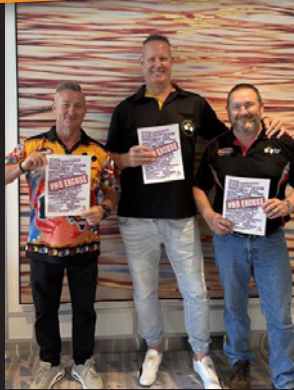
WA board members join the 16 Days of Activism against gender based violence and harassment.