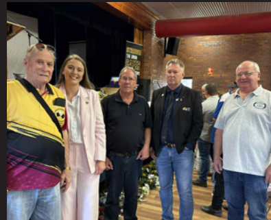
The Kinga Disaster Memorial organising committee, including QLD District and Moura Lodge representatives, delivered a deeply moving tribute service in recognition of the 50th anniversary of the disaster.