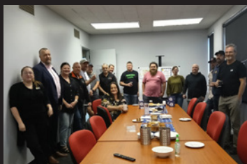
The MEU Victorian district gathering for Australia's Biggest Morning Tea, raising money for the Cancer Council and their vital work to bring us a cancer free future.